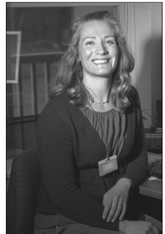
HR & Outreach Director

If you ask around at the assisted living, you might get the sense that our son is Valley Cares' baby, as his arrival was much anticipated around the house, and his visits are so endeared. It is wonderful to share this delight with—and glean knowledge from—so many grandparents and great-grandparents!