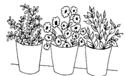
Flowers & Perennials