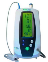
Vital Signs Monitor

As an affordable housing organization we do our best to operate on a slim budget. There are a few things we would really like to have, but we need a little help to get them. Will you consider making a donation toward these items?